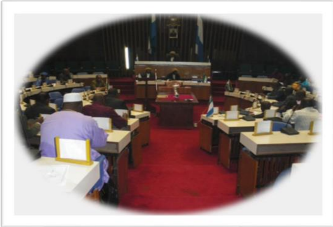
THE CHAMBER OF PARLIAMENT OF THE REPUBLIC OF SIERRA LEONE